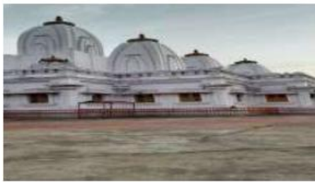
Fig. 6. Original Image