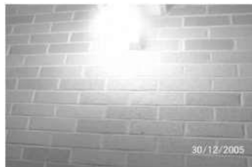
Fig. 3. Shows the luminance enrichment using global parameter x.

The x parameter is different in all regions so the transfer function also defers. The V values whatever determined split into overlapping blocks and the parameter x is calculated using the equation provided by histogram.