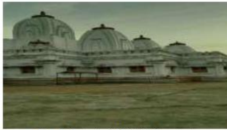
Fig. 7. Output of INDANE method

Fig. 6 shows an input image and Fig. 7 shows the performance of INDANE method.